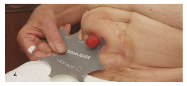
If needed use the stoma measuring guide to determine the size of your stoma.

It is important to be prepared and have all the equipment you require at hand before starting your urostomy care. You may wish to carry out the procedure in the morning before eating or drinking.