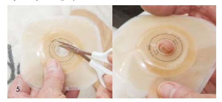
If the stoma is uneven or oval, adjust the hole in the wafer with small, sharp scissors or use the tip of your finger to even the hole to the correct stoma diameter. Remember it is important that the hole fits your stoma snugly without applying any pressure.

Gently remove the used pouch and wafer. Remember to empty the pouch before you start. As an added precaution to avoid spillage, you can place a disposable plastic bag in your waistband.