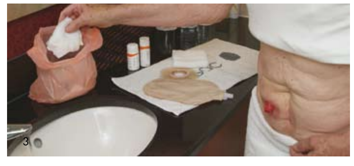
Discard the soiled pouch and adhesive wafer.