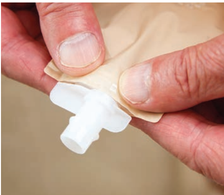
The tap is closed when you cannot see the gold tab.