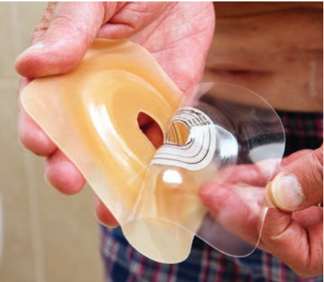
To apply the pouch, remove the protective covering from the adhesive barrier immediately before application