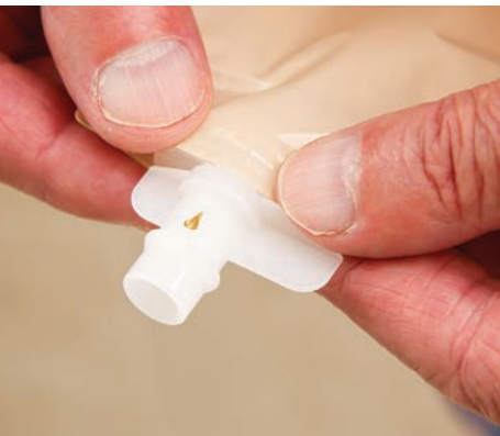
Check that the tap on your pouch is in the closed position.