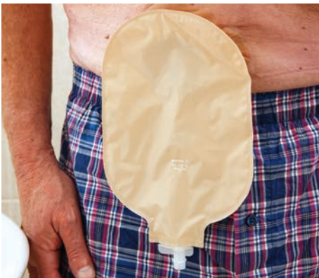
Pouch is securely in position.