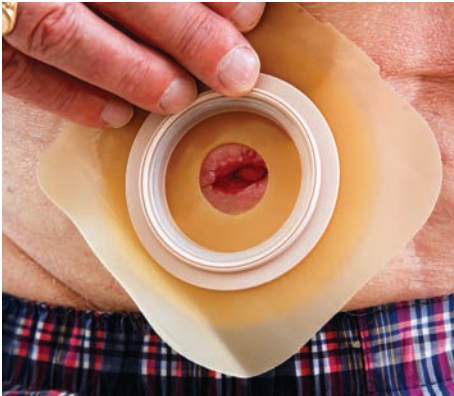
Position the adhesive barrier over your stoma. Press the barrier with your fingers from the centre to the edge to ensure it fits snugly and securely.