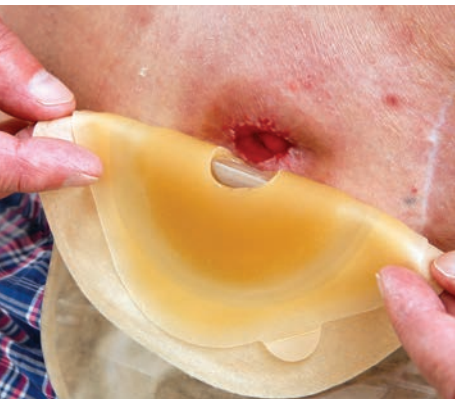
Place your pouch on by positioning the adhesive barrier on the skin immediately below your stoma.