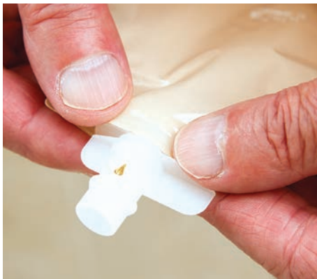
Check that the tap on your pouch is in the closed position.