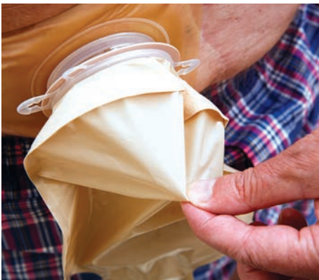
Double check that the pouch is securely connected to the barrier ring.