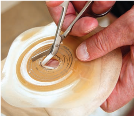
Adjust the starter hole with small sharp scissors taking care to follow the outside edge of the marking. Use the tip of your finger to smooth uneven edges around the hole. It is recommended to have a 2-3mm gap around the stoma.