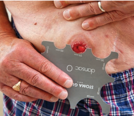
Use the stoma measuring guide to determine the size of your stoma.