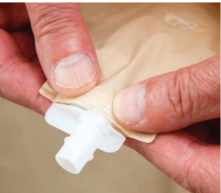
The tap is closed when you cannot see the gold tab.