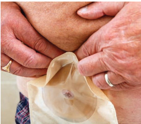
Press from centre to edge and continue around the stoma until you are certain the skin barrier fits snugly and securely.