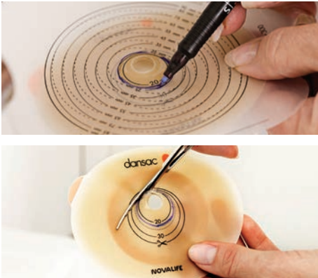
Adjust the starter hole with small, sharp scissors taking care to follow the outside edge of the marking. Make sure the hole fits snugly to your stoma. It is recommended to have a 2-3mm gap around the stoma.