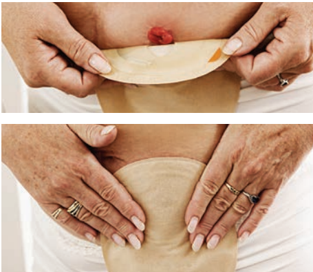
Place your pouch on by positioning the adhesive barrier on the skin immediately below your stoma. Press the barrier with your fingers, from centre to edge, to ensure it is securely in place.