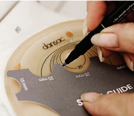
After you have measured your stoma, use the stoma guide or template to transfer the size and shape of your stoma onto the cutting guide of the adhesive barrier.