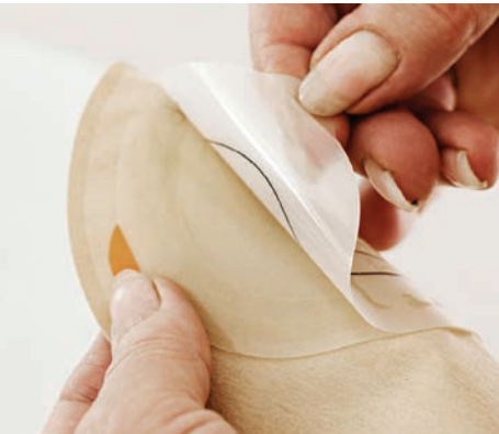
To apply the new pouch, remove the protective covering from the adhesive barrier immediately before application.