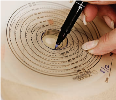
Adjust the starter hole with small, sharp scissors taking care to follow the outside edge of the marking.