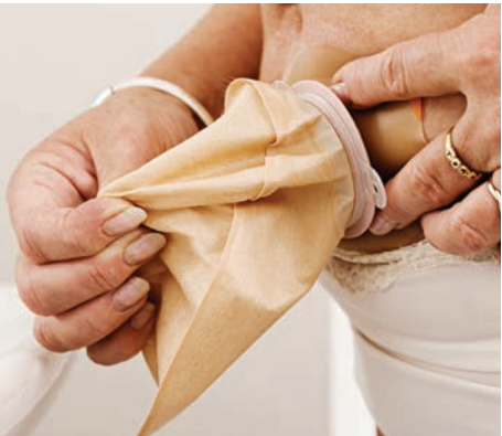
Double check that the pouch is securely connected to the barrier ring by pulling at the pouch.