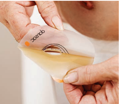
To apply the new barrier, remove. The protective covering of the adhesive barrier immediately before application.