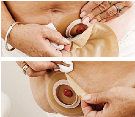
Gently remove the pouch, tighten the skin on your abdomen, by pressing it with one hand, while you carefully remove the adhesive barrier.