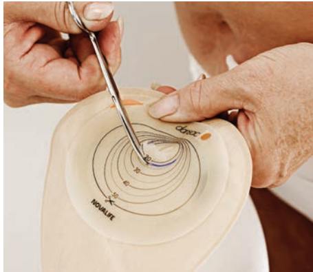
Make sure the hole fits snugly around your stoma. It is recommended to have a 2-3mm gap around the stoma.