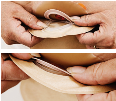
Snap the pouch onto the barrier. Use your fingers all the way around to make sure the pouch is attached to the barrier.