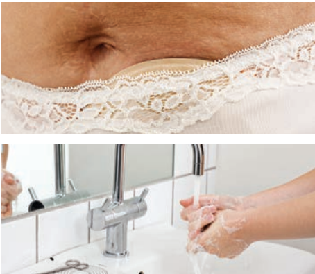
Reposition clothing when you are confident your pouch is secure. Wash your hands thoroughly after changing.