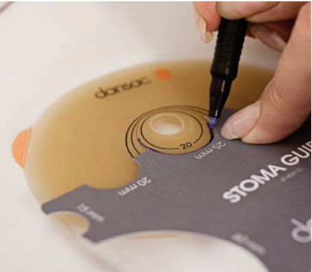
After you have measured your stoma, use the stoma guide or template to transfer the size and shape of your stoma onto the cutting guide of the adhesive barrier.