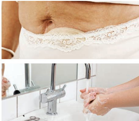
Reposition clothing when you are confident your pouch and or barrier is secure. Wash your hands thoroughly after changing.